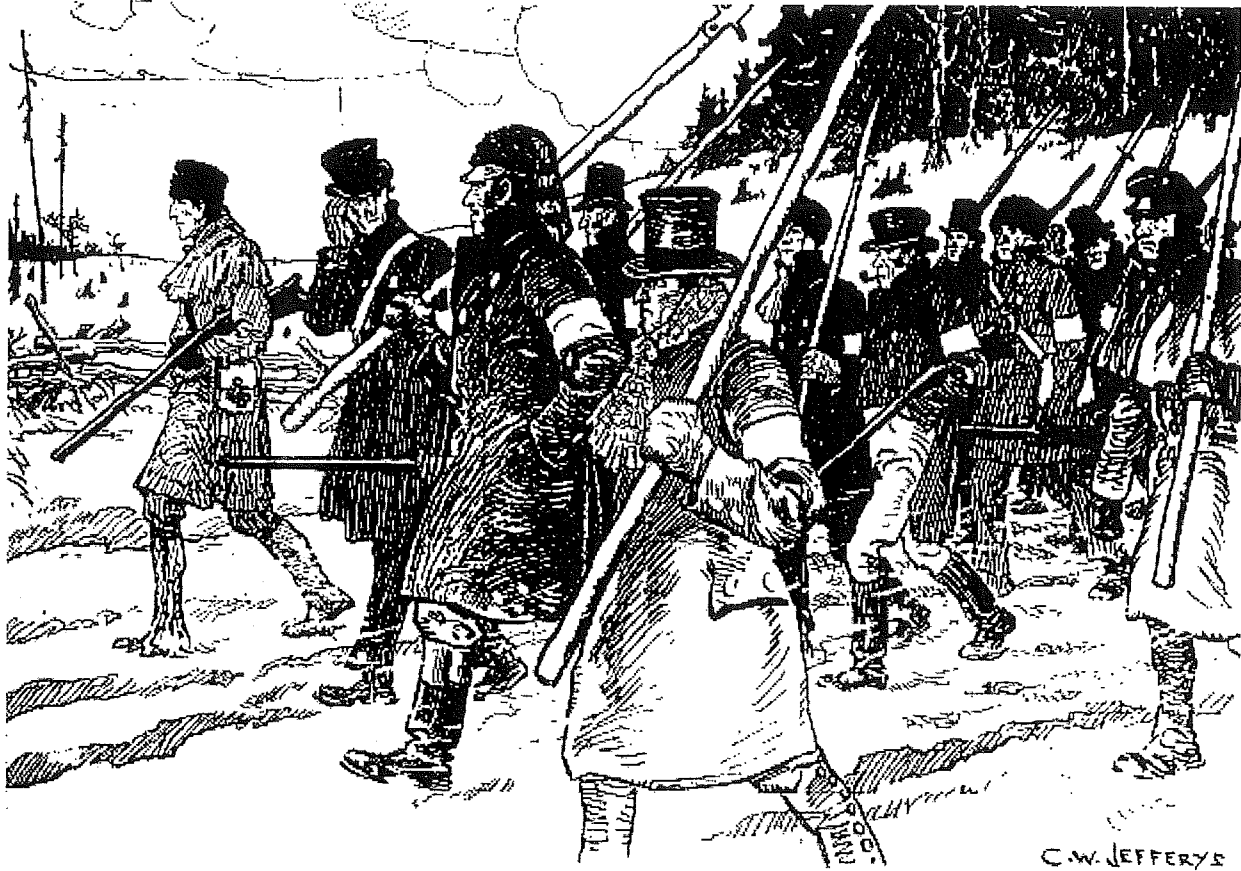
C.W. Jefferys, The March of the Rebels upon Toronto in December, 1837 , c. 1921 (b/w photograph) Government of Ontario Art Collection, Toronto

The Rebellions of 1837 and 1838 in Upper and Lower Canada are remarkable episodes in Canadian history. During these years, hundreds of armed citizens rose up against the government, protesting the injustices of the ruling elite, and demanding changes in the politics and economics of Imperial rule in British North America. In Lower Canada, disagreements between the British ruling elite and the ordinary residents took on an ethnic form. Francophone merchants and habitants, led by the rebel Patriotes , sought more control over their economy and culture. When their concerns were not heard, they fought to overthrow a government that did not have the support of the people. Both Upper and Lower Canadians joined with sympathetic Americans to launch military invasions hoping to free the colony from British rule. A number of people were killed in the insurrections, hundreds were arrested and, as a result of the Rebellions, British North Americans lost civil rights and broad democratic control of their lives. While the Rebellions had little direct impact on Aboriginal peoples in Upper and Lower Canada, the Rebellions reflected the emerging dominance of European political and economic concerns in the 'new' world.